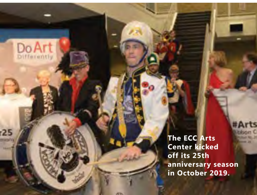
The ECC Arts Center kicked off its 25th anniversary season in October 2019.